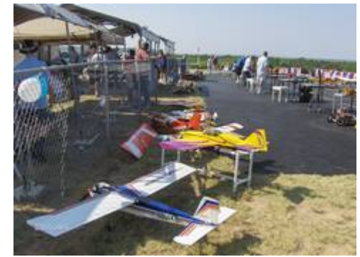
Lots of Aircraft