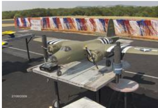
B-26 WW2 Bomber