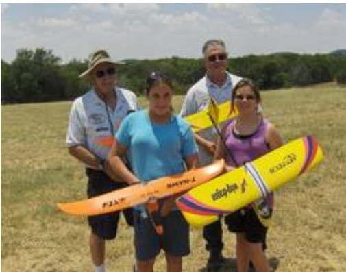
We love kids

New members and visitors are welcome. Flying activities take place mornings, weather permitting. Free flight instruction.