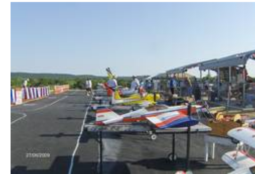
On the Flight Line