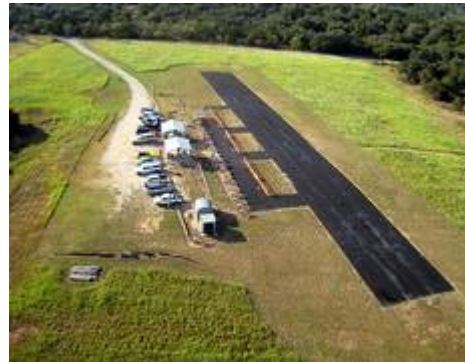
Aerial View, Hank Nilsen Field