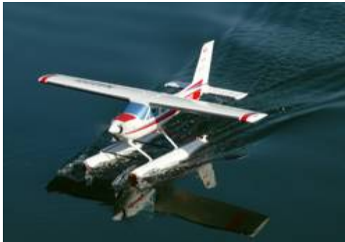
Cessna 177 on floats