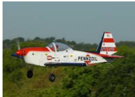
Chipmunk on Final Approach

For information about the club, visit our Web Site www.highlandlakesflyers.org