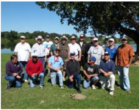
Club members enjoy a day of float flying on the Llano River